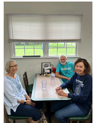
Ice cream social